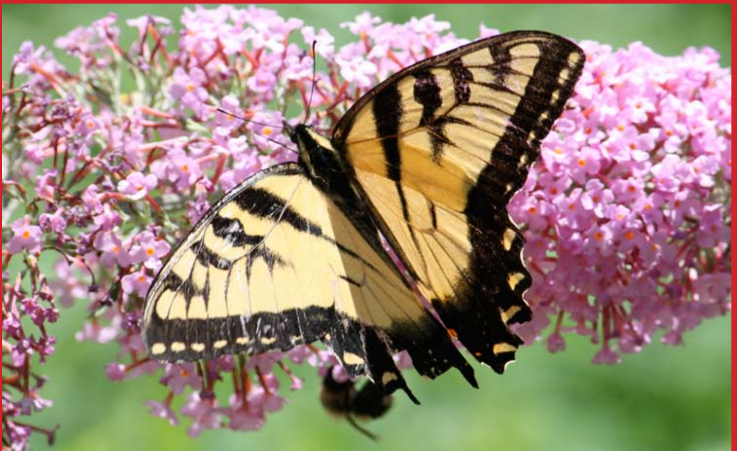
Road Four Summer 2009