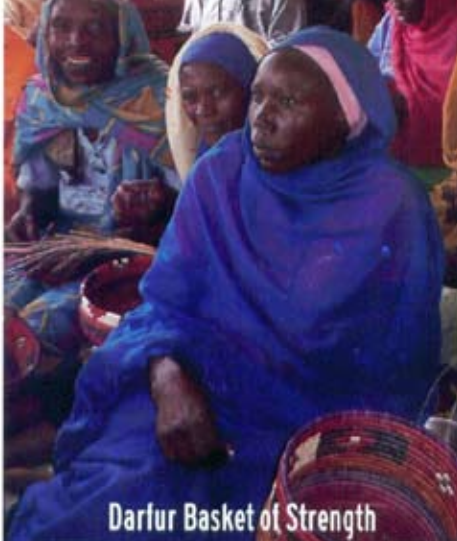
Darfur Basket of Strength

woman with enough money to support her family completely for one week!