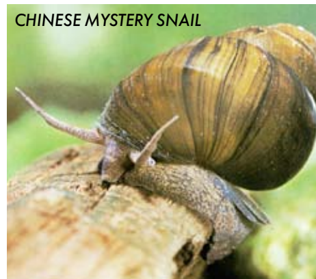
CHINESE MYSTERY SNAIL

If you encounter them, please remove them from the Lake. Like all living creatures, including ourselves, they are a host for many parasites, some beneficial; some not. They have not been shown, that I know of, to be a danger to us, but please be cautious and wash your hands if you handle them, or use a net, or rake. I know people who handle turtles can ingest a parasite they carry, giardia, which can be hard to diagnose and treat.